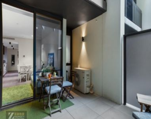
109/145 Queensberry Street Carlton, VIC